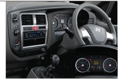
Efficient gauge cluster design