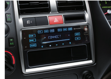
AM/FM/BT/AUX/USB Audio System