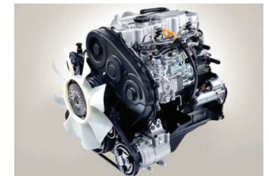
Naturally Aspirated 2.6L diesel engine

Disclaimer: For exact models, specifications and colors – please consult your Hyundai dealer. Some of the equipment illustrated or described in this leaflet may not be supplied as standard equipment and may be available at extra cost. Hyundai Nishat Motor (Private) Limited reserves the right to change specifications and equipment without prior notice.