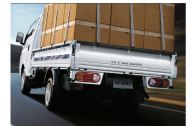
Rear Flat High Deck